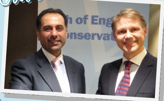
Congratulations to Morecambe & Lunesdale MP David Morris, who has been appointed the Government's new self employed ambassador