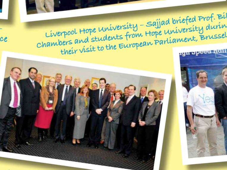
Chancellor George Osborne met with the Conservative Group of MEPs whilst he was in Brussels at the latest meeting of EU finance ministers. Mr Osborne is battling for Britain on the recent agreement to strengthen EU banks and increase the size of the eurozone rescue fund.