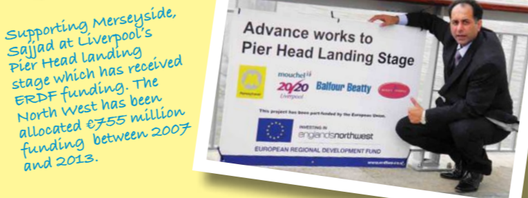
Supporting Merseyside, Sajjad at Liverpool's Pier Head landing stage which has received ERDF funding. The North West has been allocated €755 million funding between 2007 and 2013.