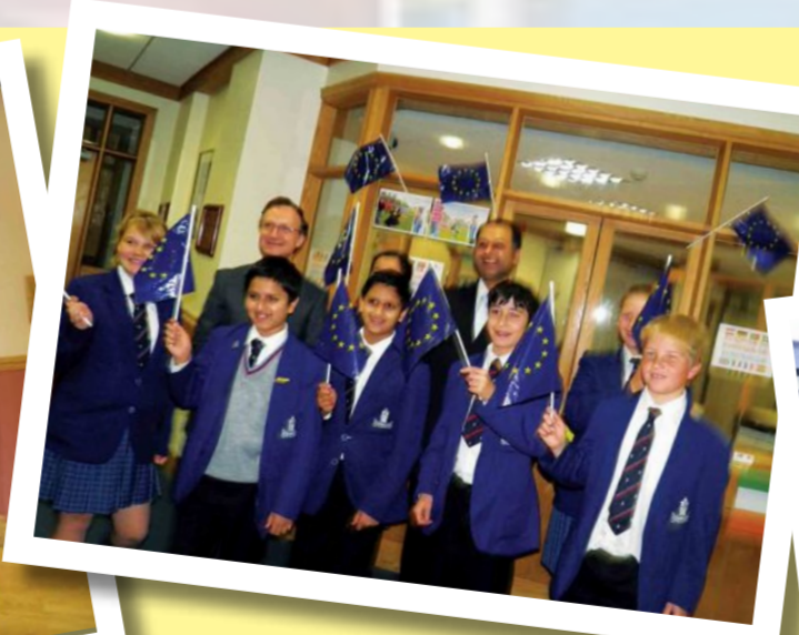
Queen Elizabeth Grammar School, Blackburn invited Saj to their annual European Day. Continental breakfast followed by two rigorous Q&A sessions on European issues with pupils