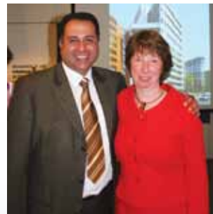
at White House with Lady Cathy Ashton, High Representative of the European Union