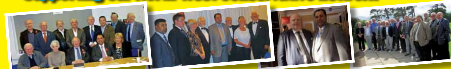
Meeting with Bolton Conservative Group