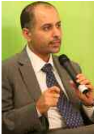
Europe was a big talking point at the #CW13 Conference. See page 6

Where David Cameron has taken the lead, other European leaders must follow his example and seize the chance to refocus the entire organisation to improve competitiveness and move it away from its desire to meddle needlessly. This would increase the legitimacy of the EU.