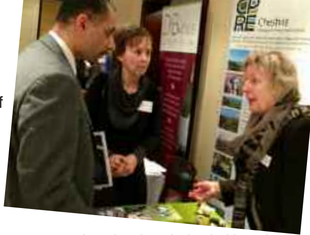
Learning about the invaluable work of the CPRE in the North West.