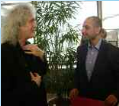
With Queen guitarist Brian May in Brussels discussing the badger cull