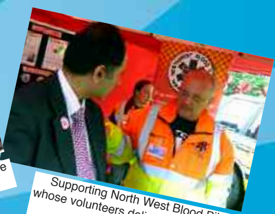
Supporting North West Blood Bikes whose volunteers deliver vital supplies to our local hospitals