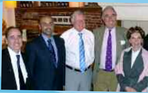
NW members in Brussels with the MEP team whilst visiting the European Parliament.