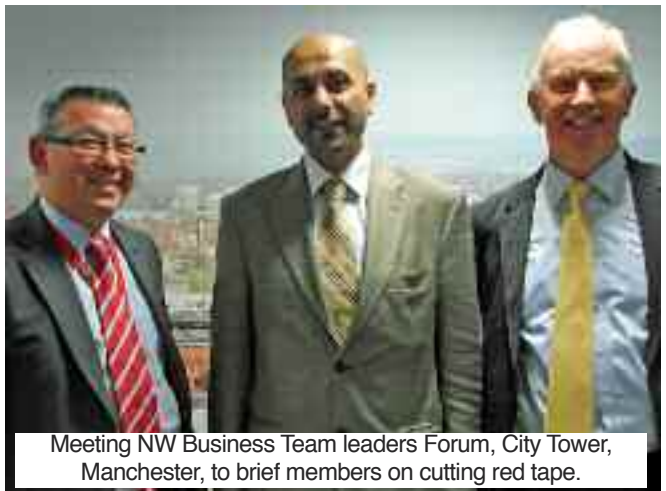
Meeting NW Business Team leaders Forum, City Tower, Manchester, to brief members on cutting red tape.