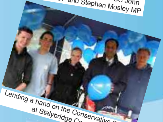
Lending a hand on the Conservative Stand at Stalybridge Carnival