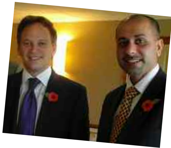
In Lancashire with new Party Chairman Grant Shapps MP. - Nov 2012

Britain is in a global race today. To succeed in that race we must deal with the deficit so we pay our way in the world and make