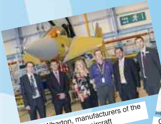
BAE Wharton, manufacturers of the Typhoon aircraft