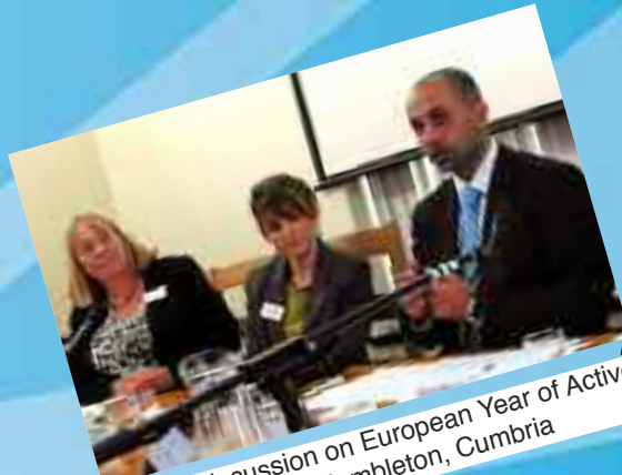
Panel discussion on European Year of Active Ageing, Hambleton, Cumbria